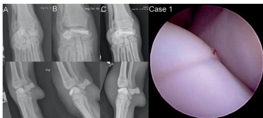
Fig. 2 Case 1 dorso-palmar (top) and medio-lateral (bottom) radiographs. A) Taken preoperatively. B) Taken six weeks postoperatively. C) Taken 12 months postoperatively. Preoperative radiographs document presence of the fissure plane in a typical location running from the centre of the radio-carpal joint proximally, toward the second carpal bone distally. Orthogonal views confirm acceptable implant placement approximately 30° to perpendicular to the fissure plane. Some loss of edge margin definition of the fissure plane is apparent 12 months postoperatively, but there is some persistent radiolucency suggestive of incomplete union. Marked dorsal soft tissue swelling is present. Preoperative arthroscopic image (far right) demonstrates appearance of the faintly discernable subchondral bone fissure with intact overlying cartilage.

with 0 representing normal and 10 non-weight-bearing lame), discomfort on manipulation of the carpus and other thoracic limb joints, carpal range of motion, and presence of palpable swelling or effusion. Pertinent findings were recorded.