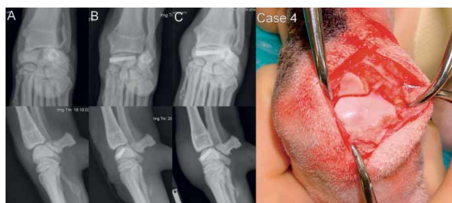
Fig. 4 Case 4 dorso-palmar (top) and medio-lateral (bottom) radiographs. A) Taken preoperatively. B) Immediately postoperatively. C) 24 months post-operatively. Orthogonal views confirm acceptable implant placement approximately 15° to perpendicular to the fissure plane. The fracture plane remains radiographically visible 22 months postoperatively, suggestive of incomplete osseous union. Moderate to marked dorsal and medial soft tissue swelling is present. Intraoperative photograph (far right) demonstrates appearance of the minimally displaced fracture line which includes fracture of overlying cartilage.

sure with intact overlying cartilage (►Fig. 2); however, the subchondral fissure was more apparent at arthrotomy when oblique indirect illumination was employed (►Fig. 3). In order to achieve this at arthrotomy, the light source from the arthroscope was held at an oblique angle to the presumed direction of the fissure, at a distance of approximately 2–3 cm. The fissure plane was evident as a subtle dark line beneath intact articular cartilage (►Fig. 3). Cases 3 and 4 did not undergo arthroscopy; both cases had complete fracture of the radial carpal