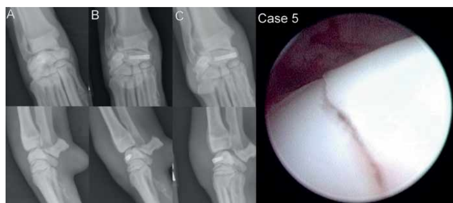
Fig. 5 Case 5 dorso-palmar (top) and medio-lateral (bottom) radiographs. A) Taken preoperatively. B) Six weeks postoperatively. C) 13 months postoperatively. Orthogonal views confirm acceptable implant placement approximately 15° to perpendicular to the fissure plane. The fracture plane shows some loss of edge margin definition at six weeks suggestive of early bone healing, and is no longer radiographically visible at 13 months suggestive of complete osseous union. Moderate dorsal soft tissue swelling is present. Preoperative arthroscopic image (far right) demonstrates appearance of the fracture line extending through the overlying articular cartilage.

At six weeks, all patients demonstrated radiographic signs of early healing manifested by reduced definition of the edges of the original fissure or fracture line (►Fig. 2 and 5). Implants remained intact and there was no evidence of migration or lucency of contiguous bone. Soft tissue swelling was evident dorsally on the medio-lateral projection in all patients. At the radiographic follow-up examination (mean 12.5 months post-operatively), there were no implant-associated complications identified and three of five radial carpal bones did not have any discernable remnant of the radial-carpal fissure line (►Fig. 3 and 5). Radiolucency persisted in the region of the previous fissure or fracture line in Cases 1 and 4 (►Fig. 2 and 4) and was suggestive of incomplete osseous union, but in light of the positive clinical outcomes, no further investigations were performed.